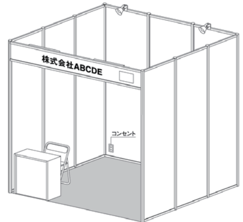
〈Details of Shell Scheme Type〉